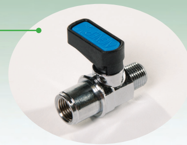
Flow control valve regulates nozzle spray.