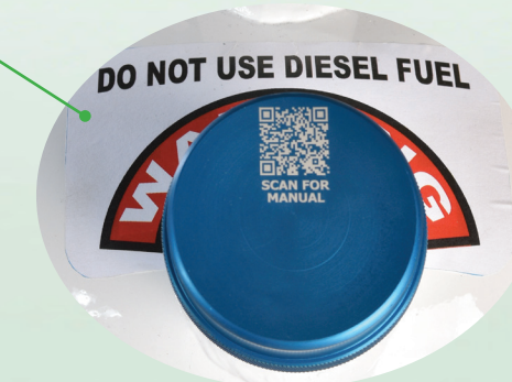
Safety cap with QR code to operator's manual.