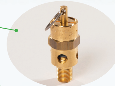
Safety relief valve.