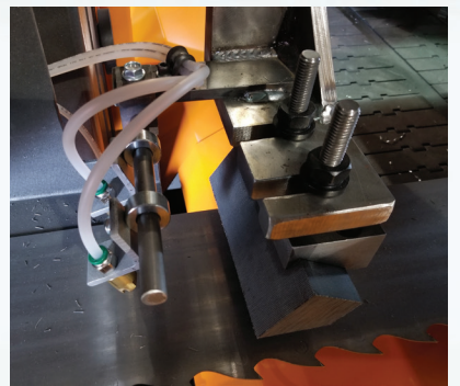
Atomizes the correct Lubie® formula for specific applications.