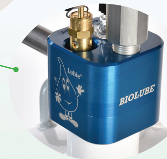
Venturi block and manifold designed with safety and durability in mind.